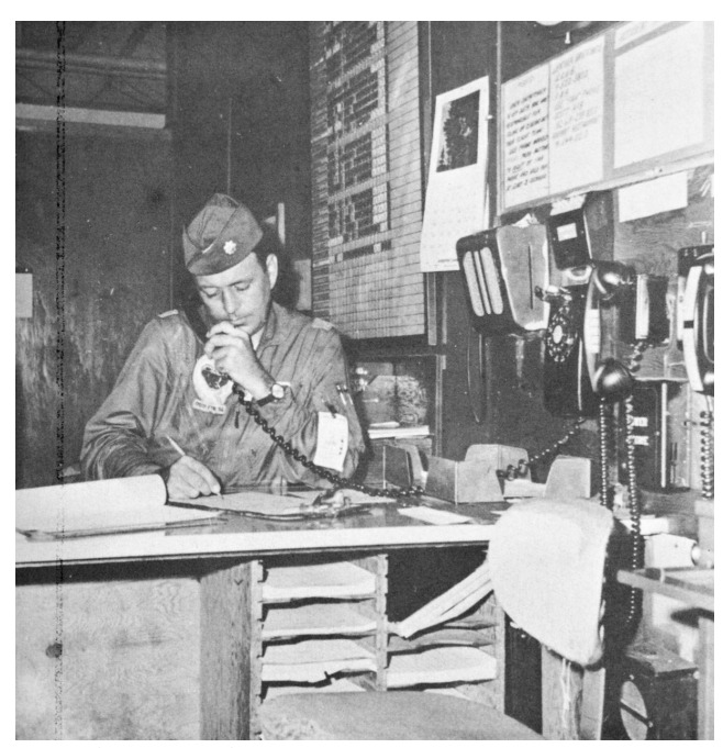
F-84 pilot in squadron operations