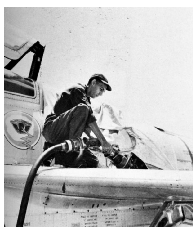
Refueling a squadron F-84

The first F-84F arrived on 2 February 1955 and the F-86 was phased out. The Thunderstreak was to become a permanent fixture around Springfield for many years to come.