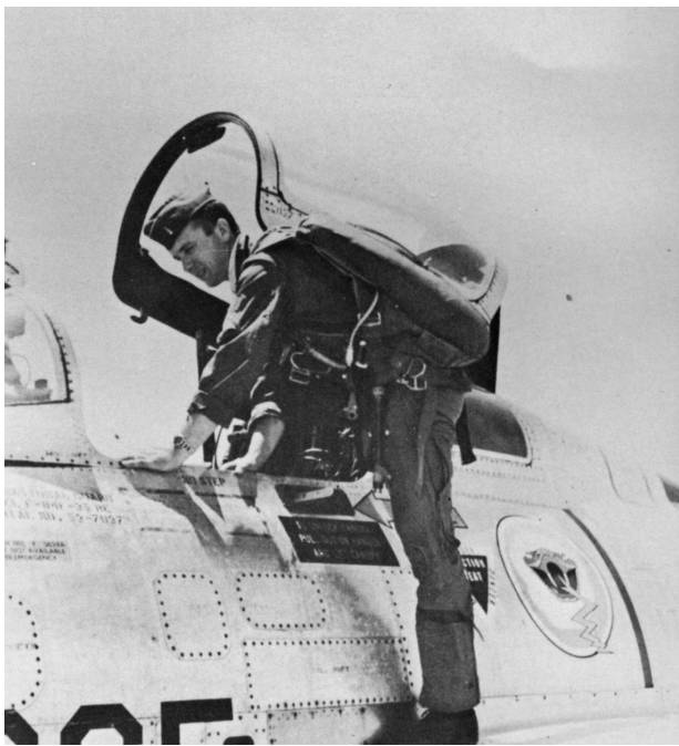
Pilot boarding his F-84